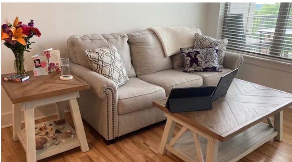
We've all gotten creative this year. This is one of our Associate's home office!